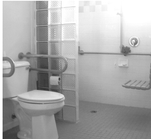
Roll-in shower and toilet with grab bars