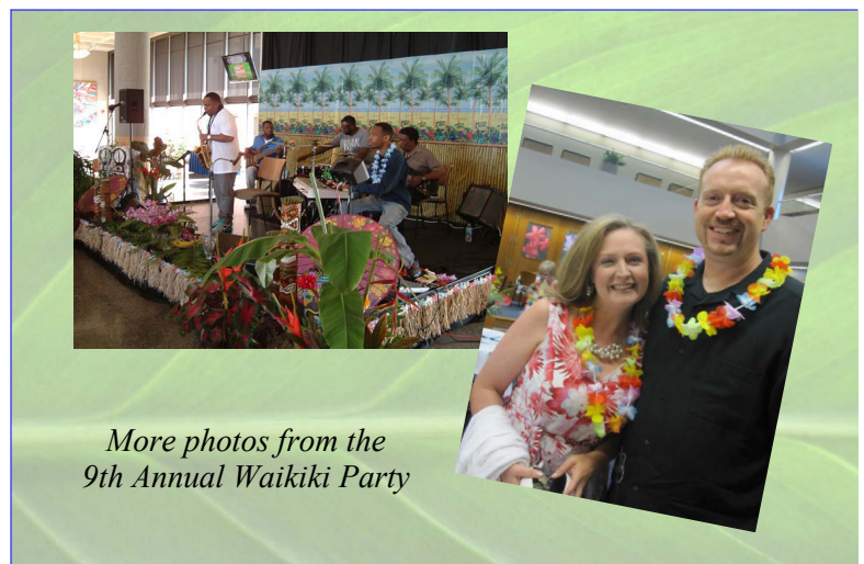
More photos from the 9th Annual Waikiki Party

The Americans with Disabilities Act requires equal access for people with disabilities using trained service dogs in public accommodations and government facilities. Under the Fair Housing Act, housing providers have a further obligation to accommodate people with disabilities who, because of their disability, require trained service dogs or other types of assistance animals to perform tasks, provide emotional support, or alleviate the effects of their disabilities